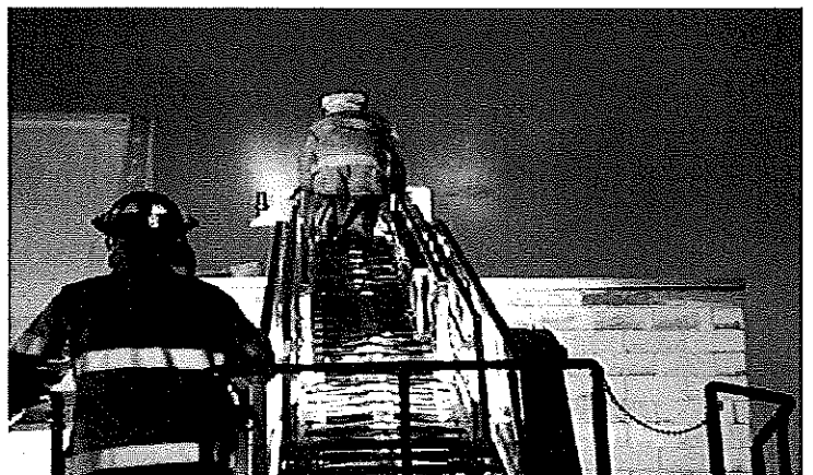
Pictured above, Monclova Township Firefighters at Toledo Training Academy on Airport Highway, practicing hose advancement for upper story of structure with the township's ladder truck.

It is the property owner's responsibility to maintain mailboxes, posts and supports in the proper condition and location. As a courtesy, a mailbox that goes down as a result of snow removal operations on a township road is temporarily repaired as quickly as possible to minimize disruptions in mail delivery. If a properly installed mailbox (see www.monclovatwp/mailbox_regulations.html ) is struck by our equipment, it is restored to original condition when scheduling and weather permit. Improperly installed mailboxes or mailboxes knocked down by the weight of the snow receive no further repair or adjustment. Resident comment/complaint forms can be found online-use for winter issues.