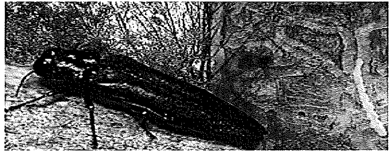
The Emerald Ash Borer

Monclova Township supports an Ash tree owner*s right to determine for themselves whether a pesticide treatment to fight the Emerald Ash Borer (EAB) insect is appropriate in their specific circumstance. Tree owners are encouraged to thoroughly research the various treatment options currently available and carefully weigh the costs associated with the required repeated treatments. Treatment of an ash tree may prolong the life of a tree until a natural predator or other viable option for the eradication of the EAB are discovered. If there is an Ash tree in the public right of way in front of your home you may choose a chemical method to try and save it with prior township approval. This work must be carried out by a licensed pesticide applicator. The township has the authority to remove street trees infested with EAB regardless of whether it has been previously treated with a pesticide or not. The trustees encourage Ash tree owners to contact the Ohio State Extension office (419-578-6783) to find out about all options for your tree.